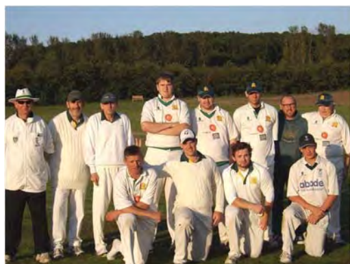
Hunton Sunday XI Team

Playing numbers were generally good; we did not concede a single game through lack of numbers and generally played with 11 men in all three sides (although some of us played more than we should have done!). Our Saturday sides seemed to get their pictures into the KM more often than most – about six times this year; we reckon the ground must be on the photographer's route home after his pub lunch!