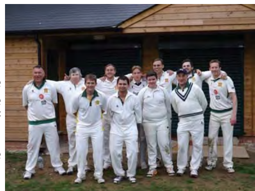
Hunton Saturday 1st XI Team

The 2015 season has generally been a success for the cricket club; both the Saturday 1 st team and the Sunday XI competed well in their respective leagues and both finished 3 rd , narrowly missing promotion. The Saturday 1 st XI were desperately unlucky, missing out on promotion by just four points on the last day of the season and despite winning their final game. For the Sunday XI it was a clearer picture; they had lost their chance of promotion some two games earlier, but nonetheless defeated Higham & Mockbeggar, placed 2 nd , on the last day of the season, again falling short by that tantalising four points. Had it not been for rain-affected fixtures earlier in the season, against theoretically weaker opposition, the side would have almost certainly gone up to Kent Village League division 4. As for the Saturday 2 nd XI, they finished a creditable mid table against some difficult opposition.